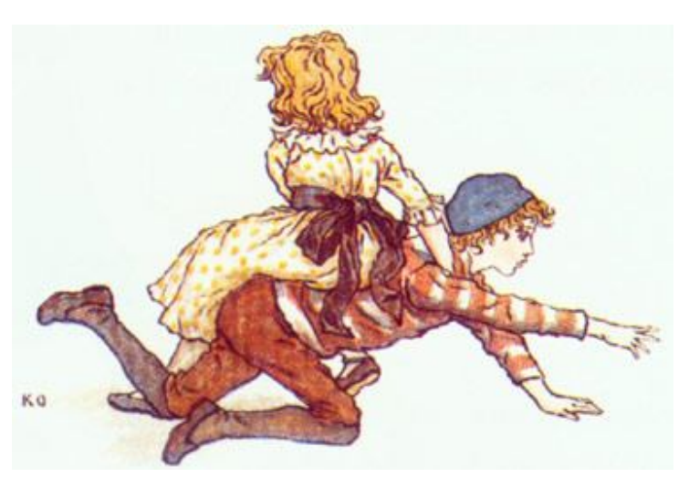
housee. First chop Pilat."

"Melican boy pleenty foolee! Melican boy no Pilat!" said the little Chinaman, substituting "l's" for "r's" after his usual fashion.