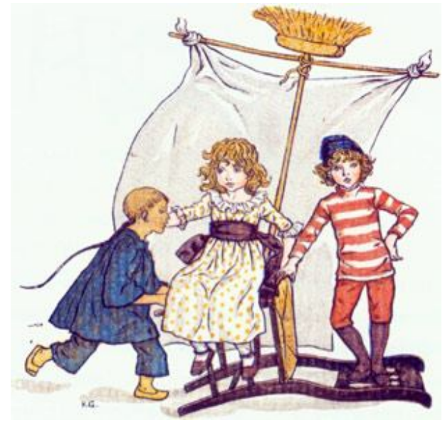
Lee stolidly rose.

It was just after the exciting capture of a merchantman with the indiscriminate slaughter of all on board—a spectacle on which the round blue eyes of the plump Polly had gazed with royal and maternal tolerance, and they were burying the booty—two table spoons and a thimble in the corner of the closet, when Wan